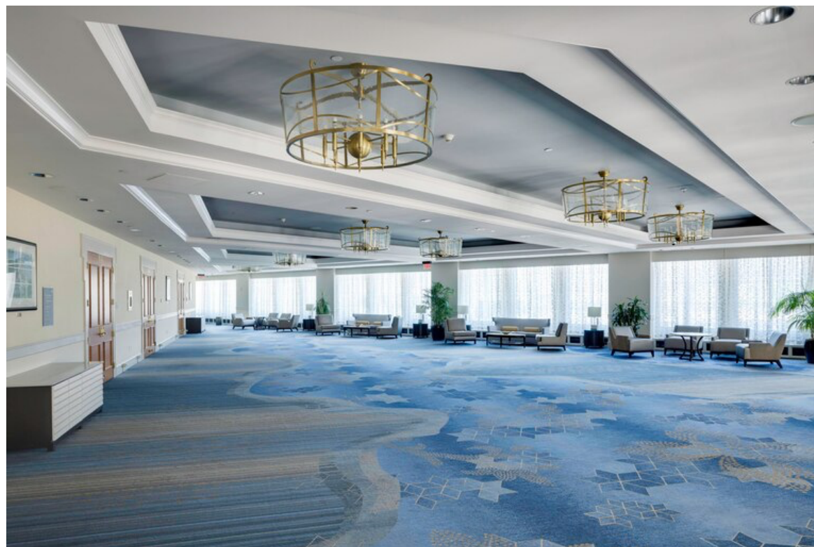
Hartford Marriott Downtown Exhibition Space

With hundreds of pharmacy professionals in attendance, visibility as a sponsor generates brand awareness, thought leadership, and places your services or product in front of a targeted, interested audience.