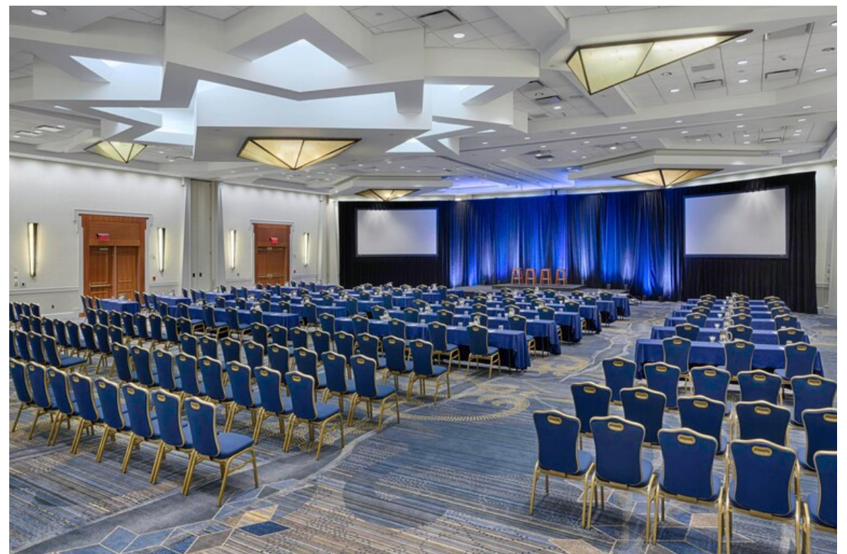
Hartford Marriott Downtown Convention Space